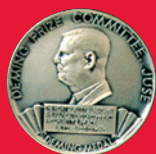
DEMING PRIZE 2003